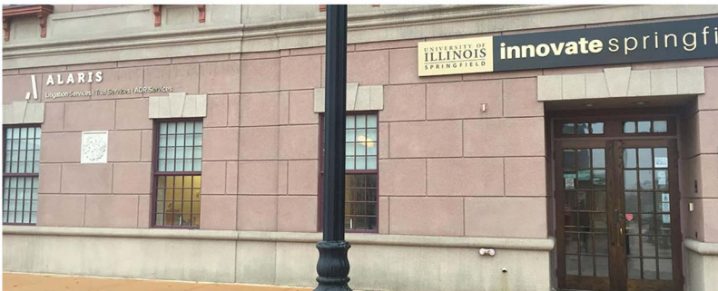
Above Right: Alaris building is on the Old State Capitol Plaza – door to the building is on the right of the photo – the left is where you will come from after exiting the Underground parking – across from the building is the Old State Capitol.