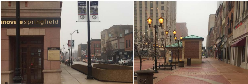
Above Left: Alaris entrance to the building on 5th St & Adams. The concrete item behind the stoplight is the exit from the Underground parking. Above Right: This little building is where you will come out of when parking in the Underground and by the Old State Capitol Plaza area – our building is towards the picture taker which is walking towards 5th St & Adams.